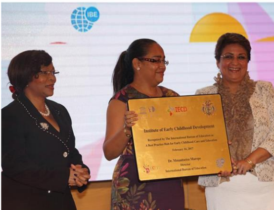
Seychelles IECD Recognized as a Best Practice Hub For ECCE

The conference was jointly organised by the Government of Seychelles and the ECCE Policy Committee, with technical assistance from the IBE-UNESCO. At the conference, Seychelles was certified as a best practice hub for quality Early Childhood Care and Education by IBE-UNESCO, and further consolidated its support for ECCE through a voluntary contribution to support the IBE in implementing its program around the world.