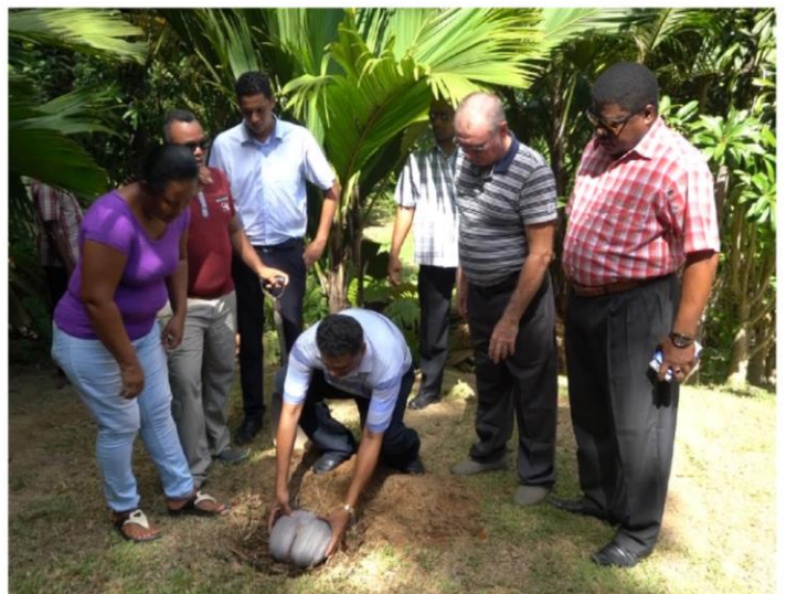
(left) President Faure planting a Coco de Mer at Fond Ferdinand Praslin

In his SONA President Faure announced that as from the 1 st of March this year, the exportation of the Coco de Mer kernel as a raw material will be banned, supporting Coco de Mer conservation efforts and the creation of value addition industries whose taxes will go directly to the Praslin Development Fund. On his visit to Praslin, the President visited the Fond Ferdinand Nature Reserve and UNESCO World Heritage Site Vallée de Mai, and emphasised the need to continue with greater efforts to preserve the 'incredible gems of Seychelles'.