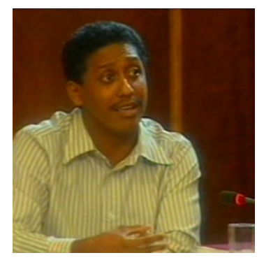
LGB in the National Assembly in 1993