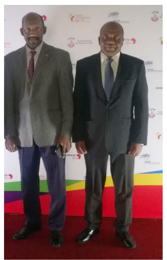
VP Meriton and PS Volcere in Bamako, Mali

In line with Seychelles' own development goals, all attendees of the summit agreed to include their actions in the framework of the Addis Ababa Program of Action on Financing for Development, the objectives of sustainable development of the United Nations, the Paris on Climate Change and the African Union Agenda 2063. Commitment to intensify the fight against poverty and inclusive economic growth was also reaffirmed, echoing the theme of the 2017 Budget in Seychelles, 'Inclusive Development and Opportunities for All'.